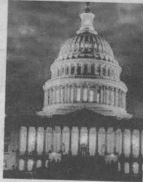
In the Senate, where Democrats now have a slim

The key contests are playing out alongside the first presidential election since the Jan. 6, 2021, attack on